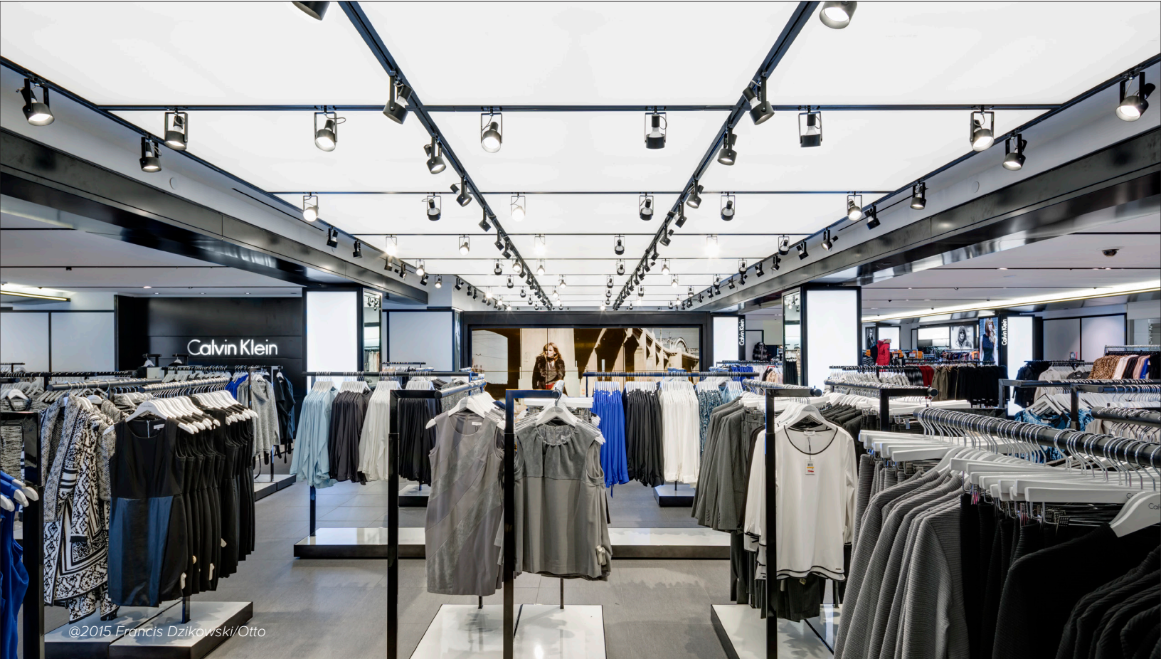
Segmented Luminous Ceiling