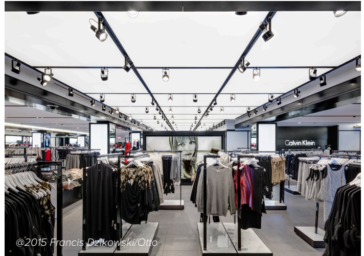
Main entrance to the "shop-in-shop"

Coolidge TILE Interior met these requirements with its low profile and adaptability. The TILES were easily mounted directly to the plywood ceiling and cut-to-fit wherever obstructions or support structures were encountered.