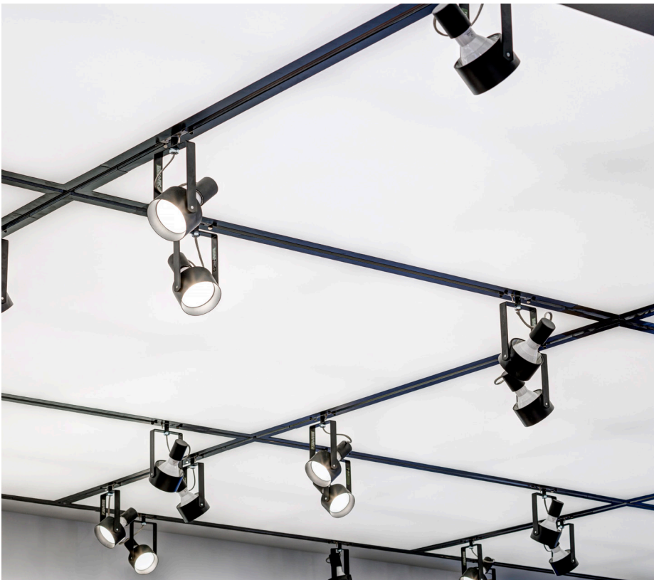
Track luminaires were added to provide the feel of a fashion runway