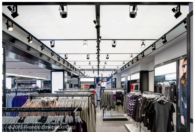
High ambient light levels were achieved within the constraints of the local energy codes